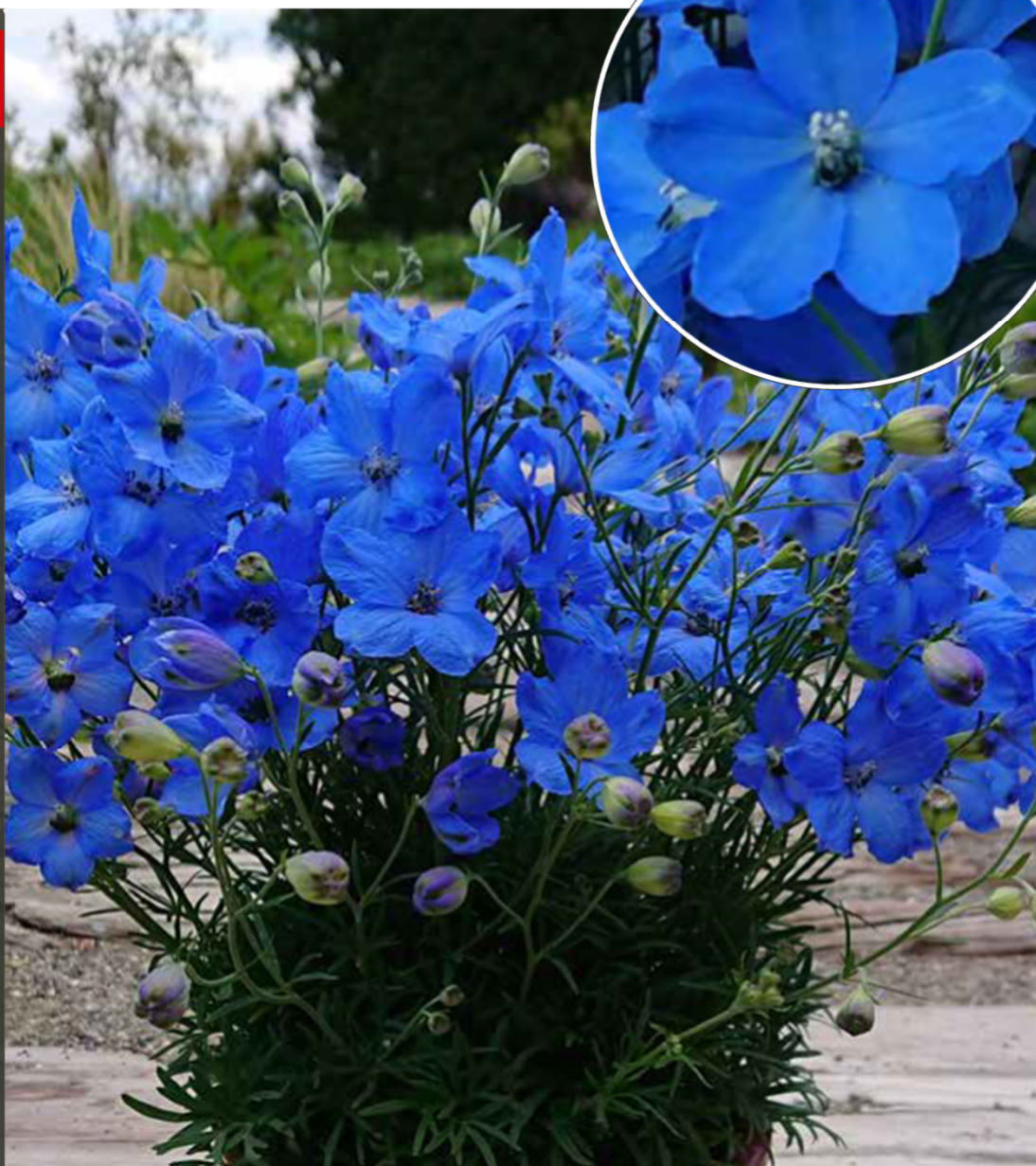
Cheer Blue, a hint of Japanese serenity for the garden.

A popular cut flower and landscaping item particularly in Japan, Delphinium grandiflorum F1 is now also available in a dwarf version. Cheer Blue is a brand-new variety with shorter stems and upwards directed flowers without spurs, making this F1 hybrid from seed an excellent candidate for patio planters and first/middle line bedding. The new, mid-blue hue of the flowers is an exciting enrichment in the existing blue color range.